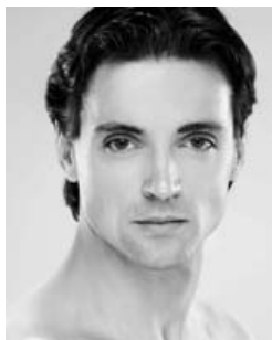
Ángel Corella (Principal and Artistic Director)