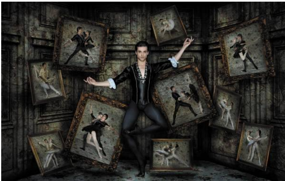
Ángel Corella & Cia in String Sextet.

Music: Peter Ilyitch Tchaikovsky (String Sextet "Souvenir of Florence" Op. 70, 1892) Duration: 24'