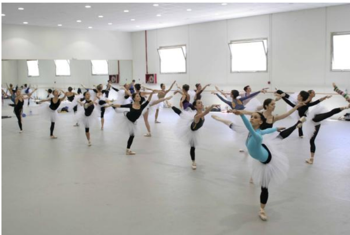
Corella Ballet in rehearsal.

Founded by Angel Corella and under his Artistic Direction, the Company consists in 60 dancers, chosen among more than a thousand applicants, coming from 12 countries: Spain, Cuba, United States, Italy, Canada, Ireland, Japan, Lithuania, Russia, Portugal, Argentina, the Republic of Georgia and Kazajstán.